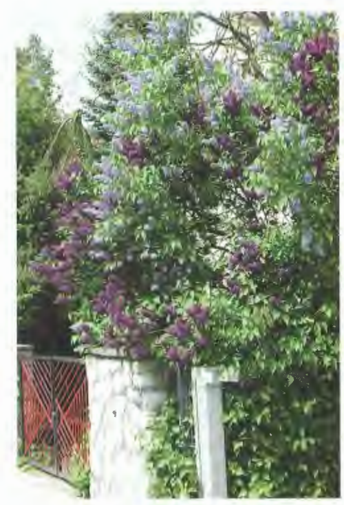
Several colors of lilacs add beauty to the entrance of a gateway in Kopening or East Berlin