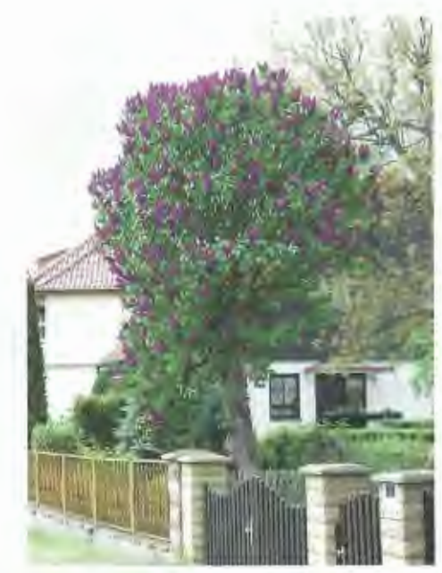
This dark purple lilac has a very impressive single trunk Again, it is probably 'Andenken an Ludwig Späth'