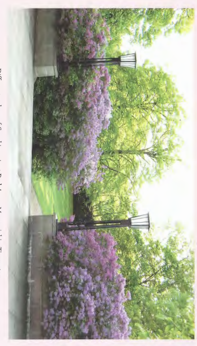
Different colors of S.× chinensis at Red Army Memorial in Tiergarten