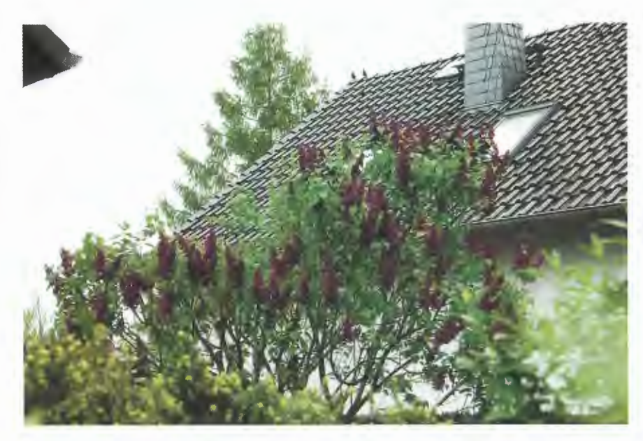
Dark purple lilacs against an eye-catching black roof make a bold statement of color and texture