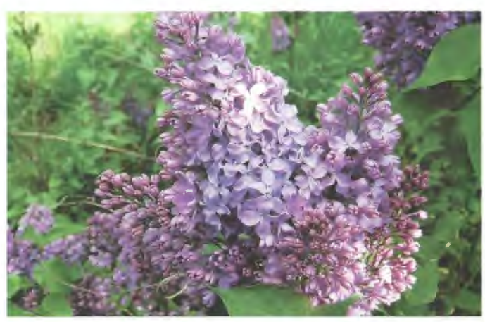
Syringa vulgaris 'Vera <u>Kh</u>oru<u>zh</u>ay<u>a</u>' at Kornik