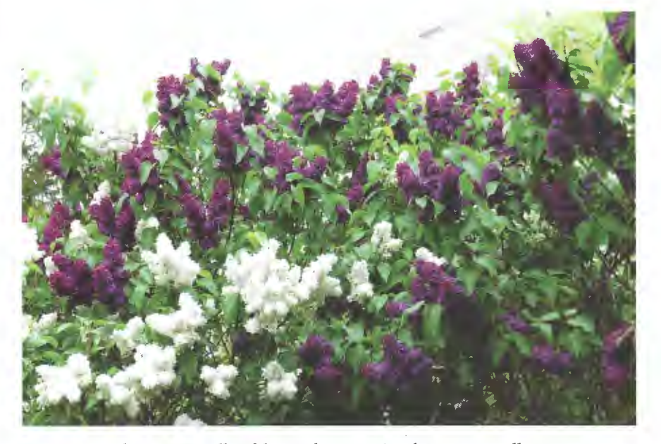
Lilacs in a small public garden near S-Bahn station Bellvue. note the beautiful combination of white with purple