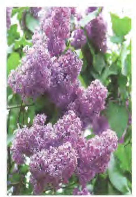
This lilac shows a noticeable recurving of the petals, one of the many forms seen in lilac florets

LILACS, Winter 2016 16 17 LILACS, Winter 2016