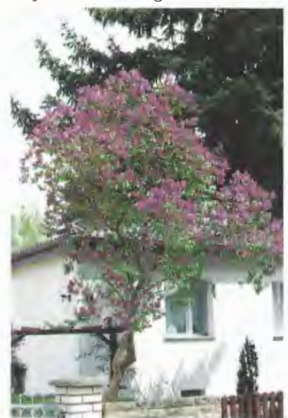
This single-trunked lilac towers over the home it beautifies