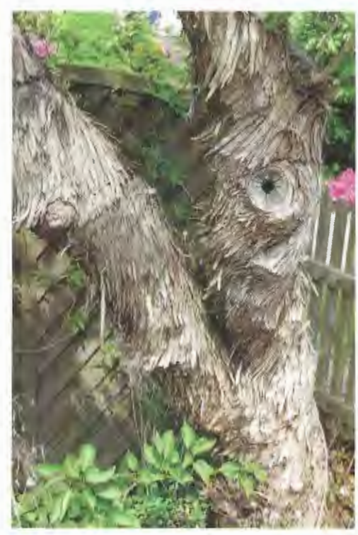
This old lilac with flaking bark is thriving despite the presence of a large borer hole in the trunk