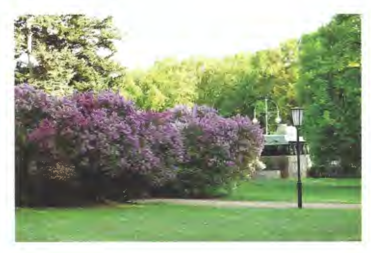
Different colors of S.× chinensis at Red Army Memorial in Tiergarten