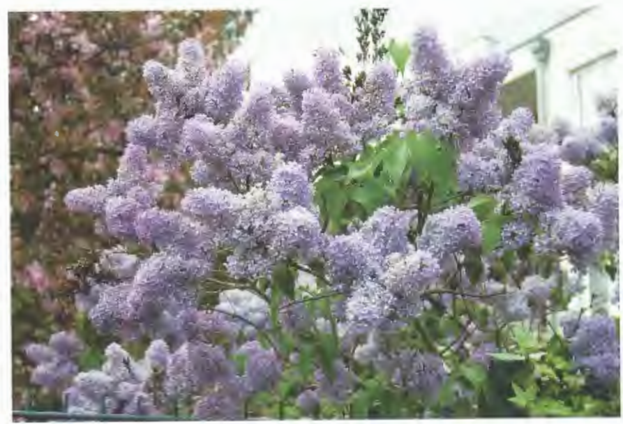
A heavy blooming lilac competes with a crabapple in the background