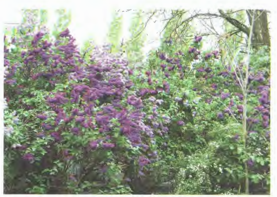
Lilacs help beautify a nondescript landscape border