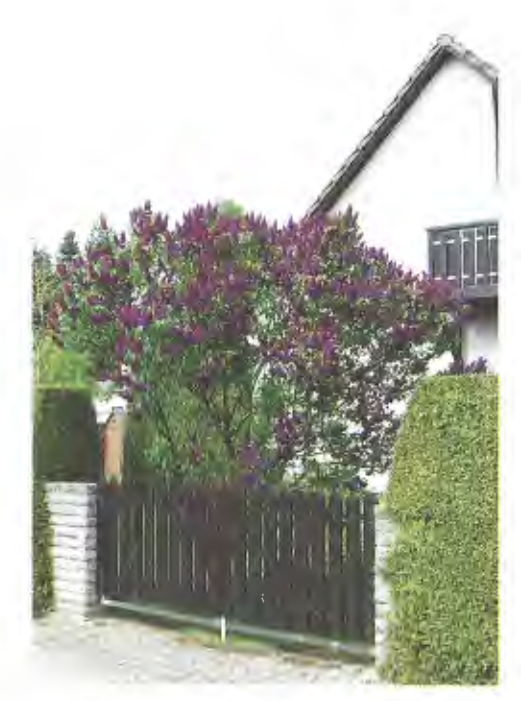
A dark purple lilac adds to the beauty of a quaint house and fence in Berlin