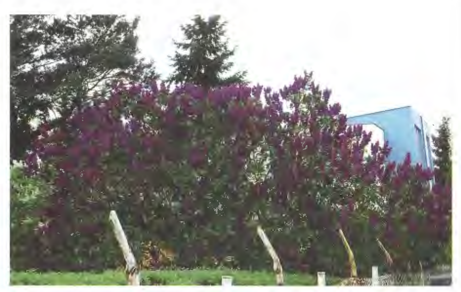
A thick screen of dark purple lilacs helps hide the ugly blue structure in back in Berlin