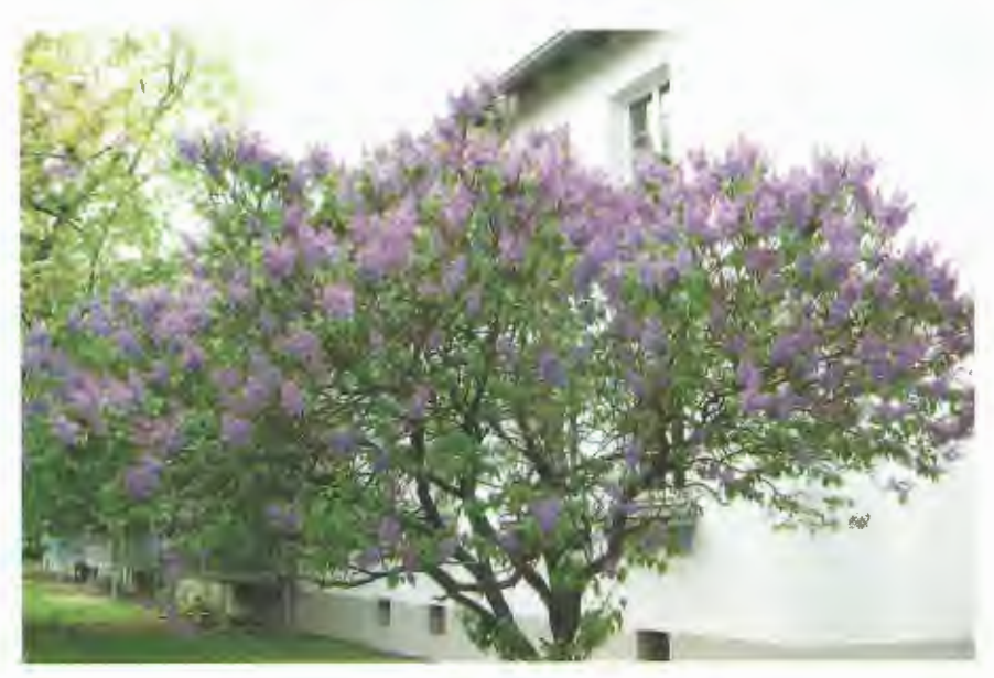
Nothing better to hide an ugly wall in Berlin than a beautiful, well-branched floriferous lilac