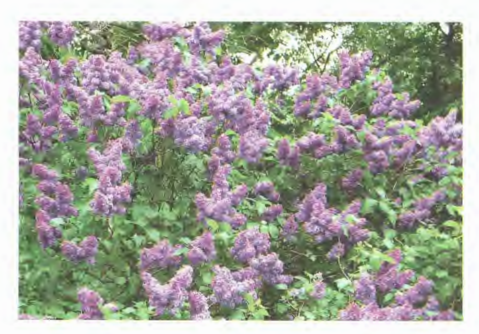
A mass of lilacs and bright green foliage is a beautiful sight to behold