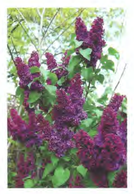
Beautiful specimen of S. vulgaris 'Andenken an Ludwig Späth' a very common cultivar in Berlin