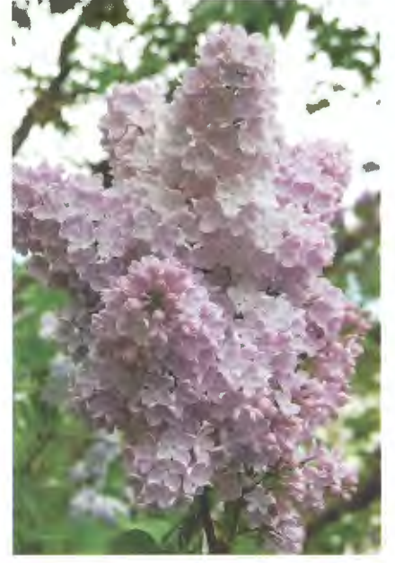
Syringa vulgaris 'Tane<u>ch</u>ka' at Minsk