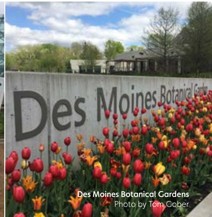
Des Moines Botanical Gardens

developed over 86 named roses between 1962 and 1985 and Reiman has many of these in their collection. Unfortunately, we were too early to see any blooms but certainly worth a return visit near the beginning of June.