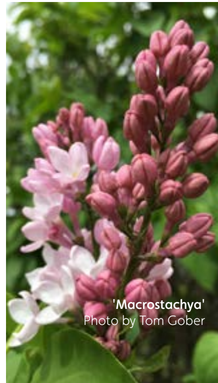
' Macrostachya '