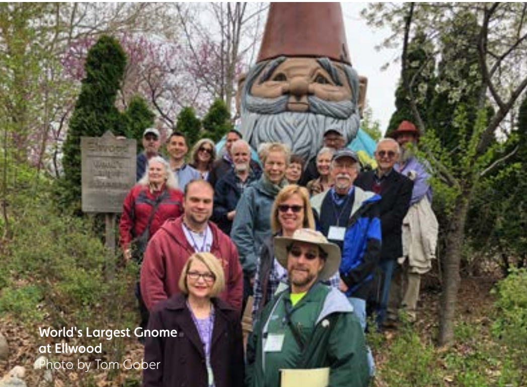
World's Largest Gnome at Ellwood

Our final day was filled with lilacs. Ewing Park's Lilac Arboretum was the final destination of the convention. Home to over 300 varieties and more than 1000 plants the gardens are set on a 35 acre park of rolling fields. Our morning began with a talk by Joel Van Roekel and then we were left to explore the arboretum. The lilacs were just beginning to bloom and many are not identified but it did