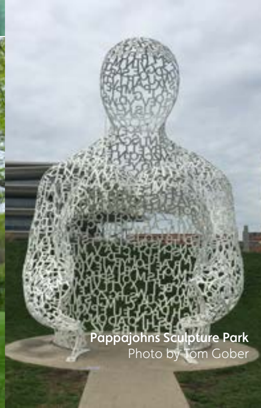
Pappajohns Sculpture Park