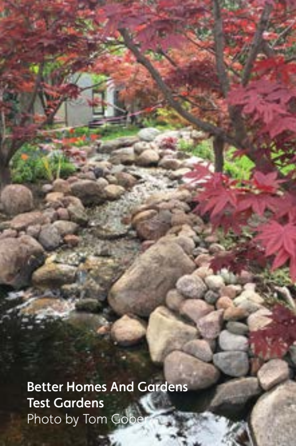
Better Homes And Gardens Test Gardens