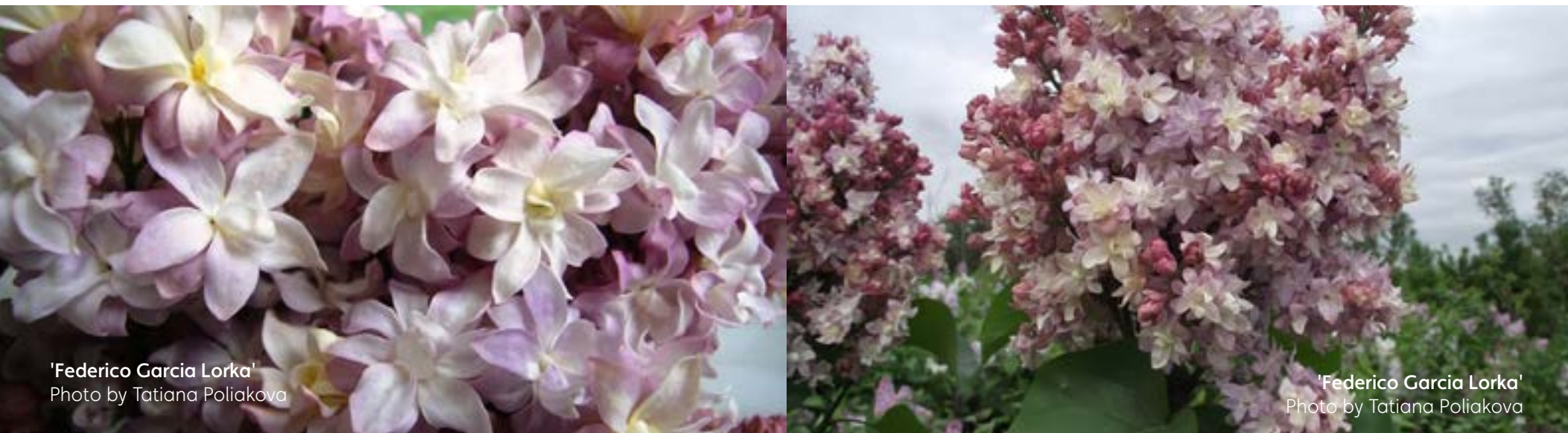
'Federiko Garcia Lorca'

In 2012, I travelled to Spain along with the children's public organization "Flower Squad". We visited several cities, including Granada, the poet's birthplace. In Huerta de San Vicente, in the Federico García Lorca House Museum, we presented a framed certificate