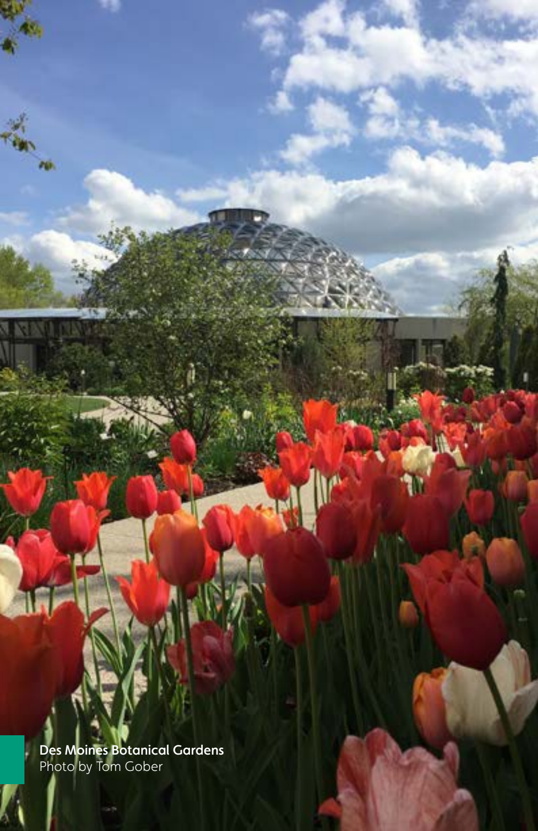
Des Moines Botanical Gardens