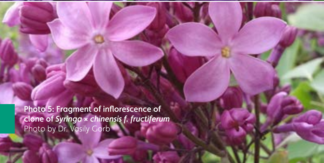
Photo 5: Fragment of inflorescence of clone of Syringa × chinensis f. fructiferum