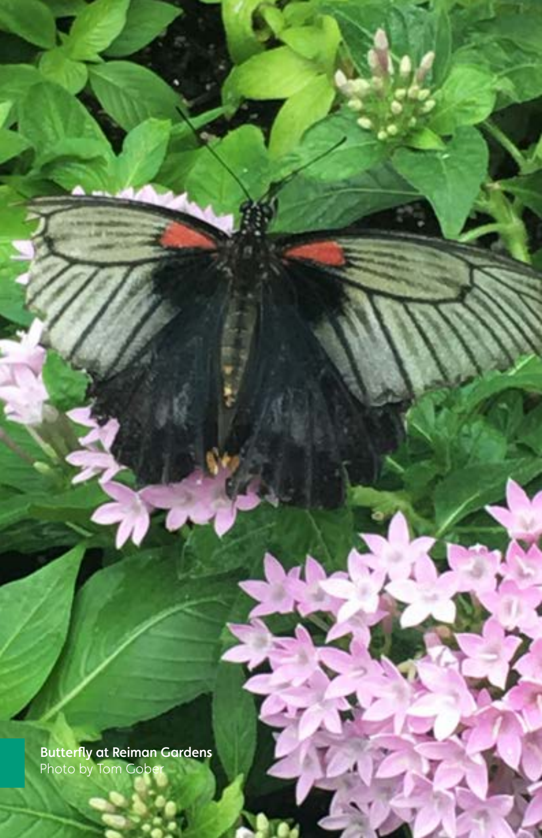
Butterfly at Reiman Gardens