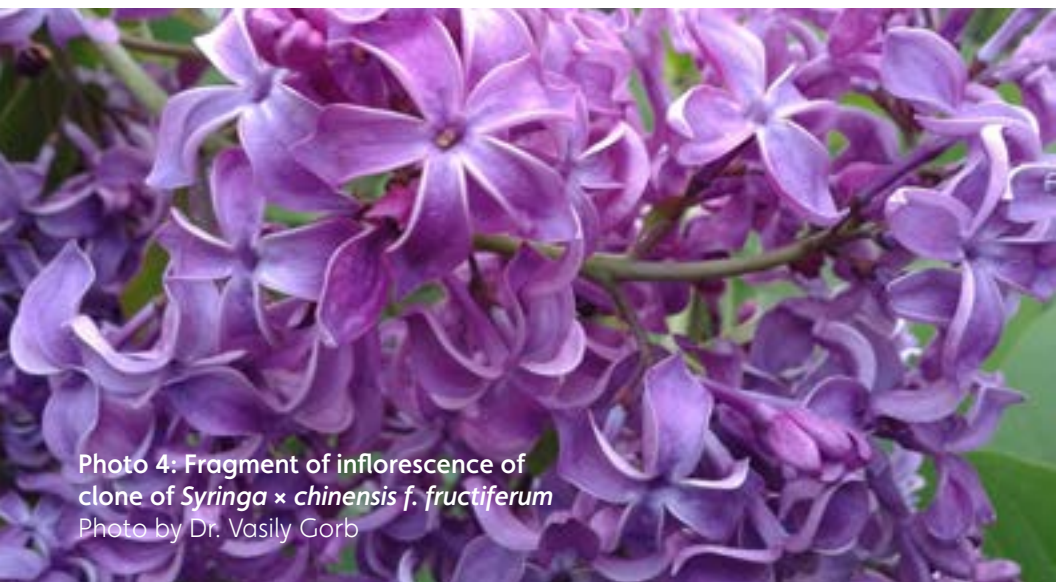
Photo 4: Fragment of inflorescence of clone of Syringa × chinensis f. fructiferum

Therefore, there is now an opportunity to breed new ornamental forms for replenishment of all the cultivars of the lilac collection (photo 4, 5), without too much artificial effort or ineffective hybridization of S. × chinensis , with genetically close species or cultivars of the Syringa genus.