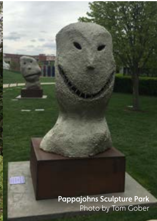
Pappajohns Sculpture Park