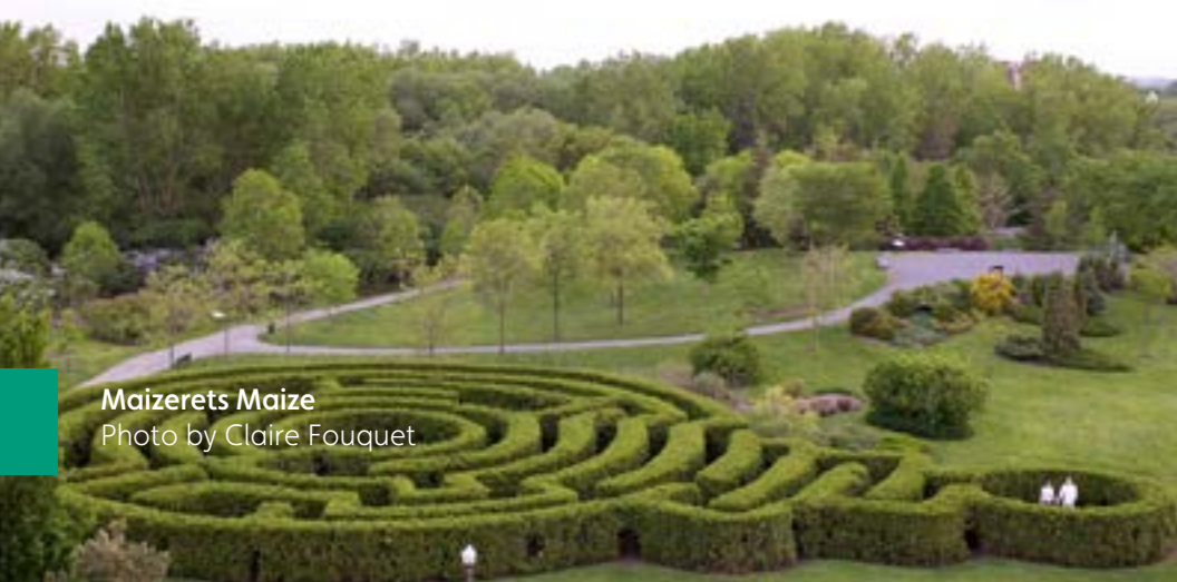
Maizerets Maize

We hope to see you in Saint-Georges in June 2020 for a memorable experience. Lodging is in a 4 stars hotel with great food and comfort (see separate information).