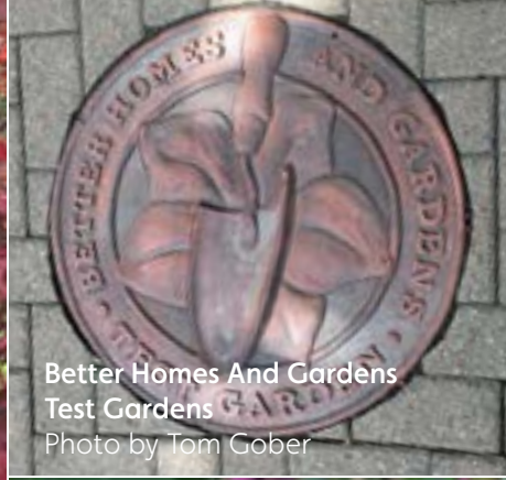
Better Homes And Gardens Test Gardens