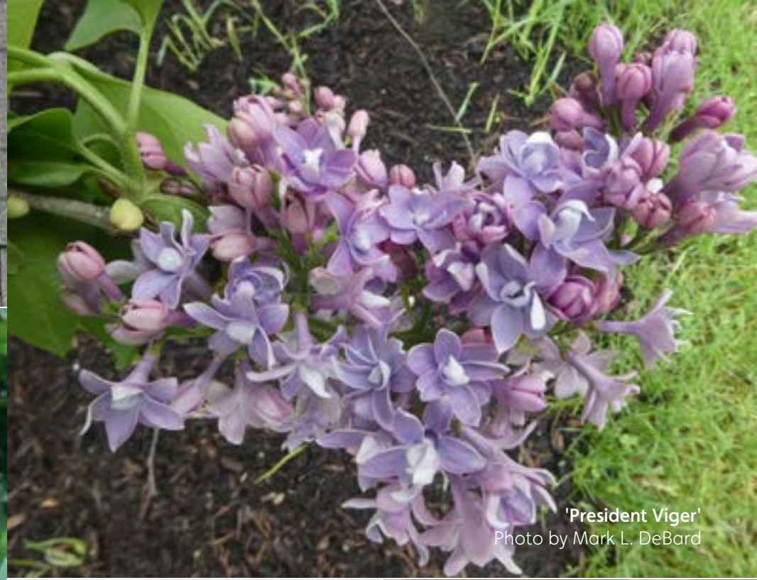
'President Viger'