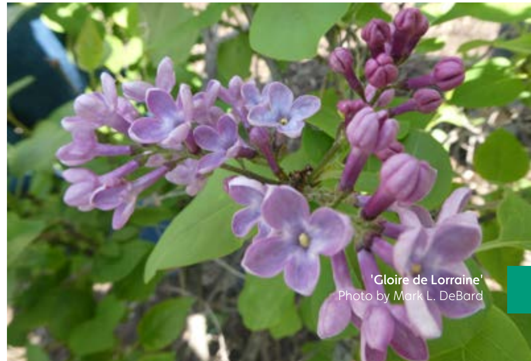
'Gloire de Lorraine'