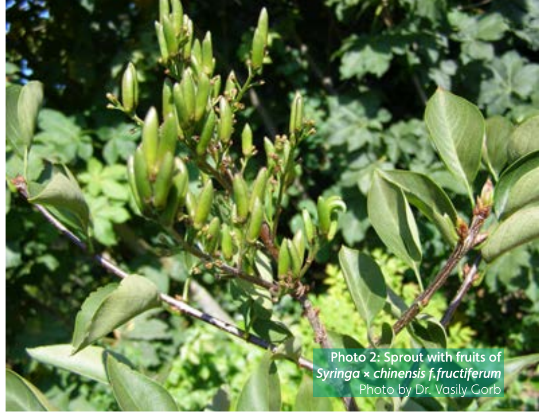
Photo 2: Sprout with fruits of Syringa × chinensis f. fructiferum

It fruited annually during the following years, but not always abundantly. The reason for this was a lack of adequate soil moisture for the formation of seeds. As a result, only 1-3% of the seeds were anatomically complete. Taking this into account, we now keep the hardwood bark soil for clones of this seedling (propagated by the rooting of cuttings) in an optimally moist state. Even in this case only 34-47% of the total collected seeds are viable. However, this is quite enough to satisfy all the needs in S. × chinensis plants. This success is also due to its high seed germination of 84-89% (photo 3). This cultivar we named S. × chinensis f. fructiferum . It