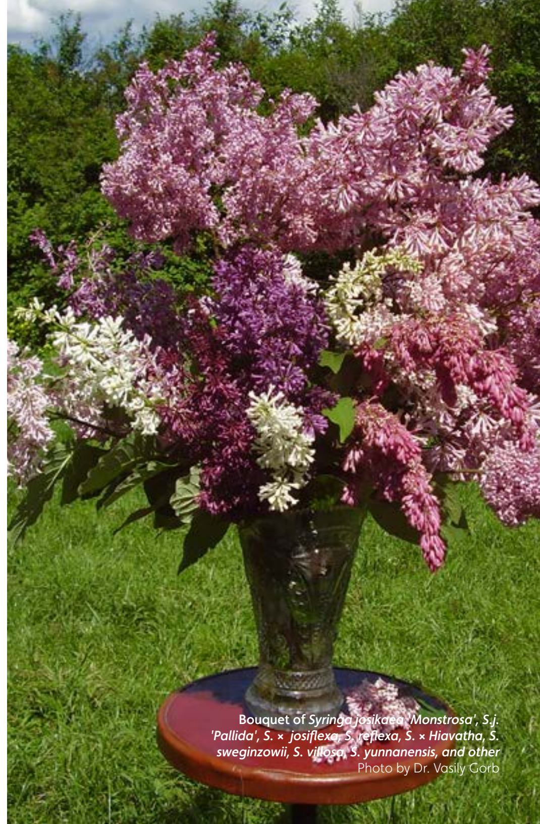
Bouquet of Syringa josikaea 'Monstrosa', S.j. 'Pallida', S. × josiflexa, S. reflexa, S. × Hiavatha, S. sweginzowii, S. villosa, S. yunnanensis, and other