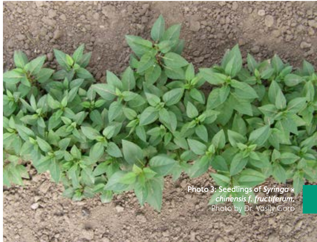
Photo 3: Seedlings of Syringa × chinensis f. fructiferum .