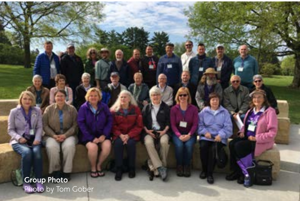
Group Photo